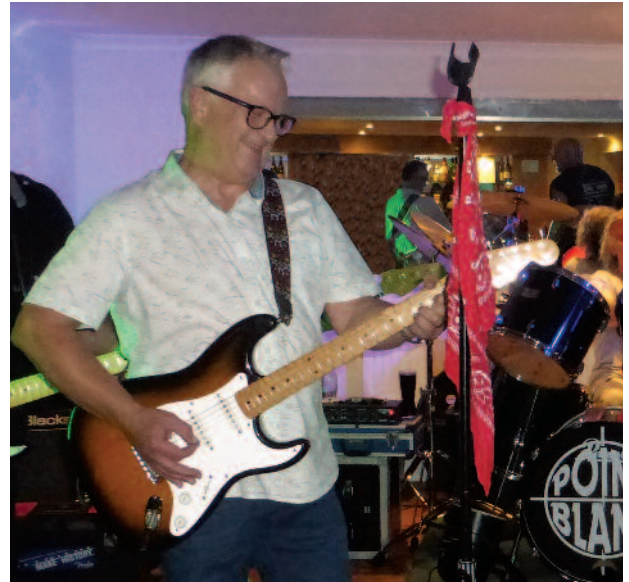
The author playing his 40th Anniversary Strat (above) during a guest appearance with Point Blank in Cornwall, UK, and pictured with the same guitar (facing page).